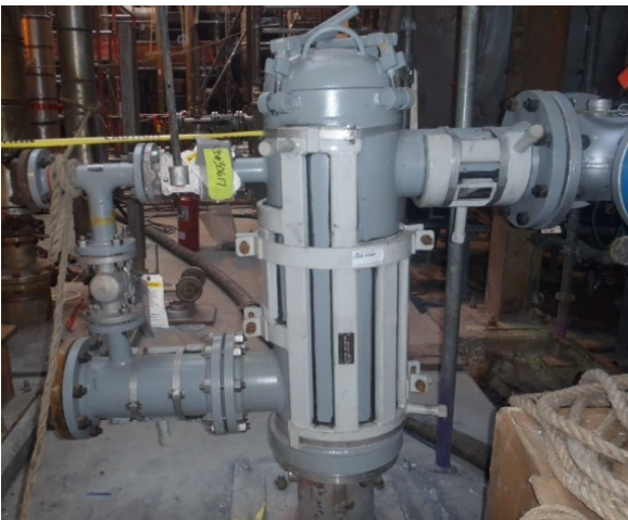
S x Seal™ 1000 installed at Houston, TX refinery

To ensure optimal performance at the intended location, CSI offers four standard S x Seal™ 1000 models, which are designed for various operating ranges of sulfur flow rate and differential pressure. For example, the